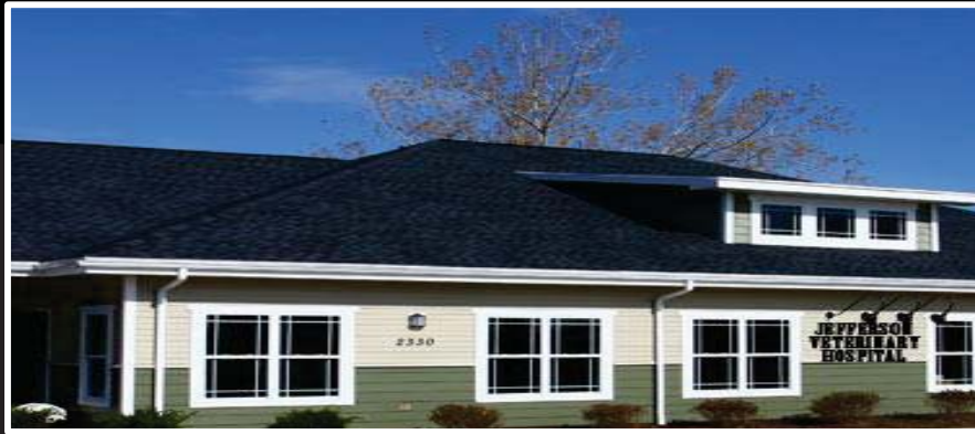
Jefferson Veterinary Hospital