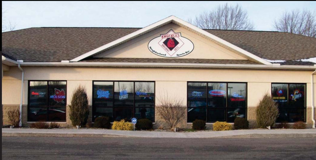
Knuckles Knockout Grill